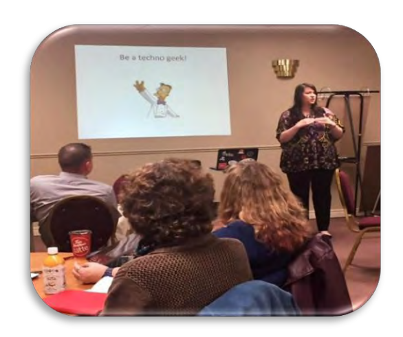
Social Media Marketing